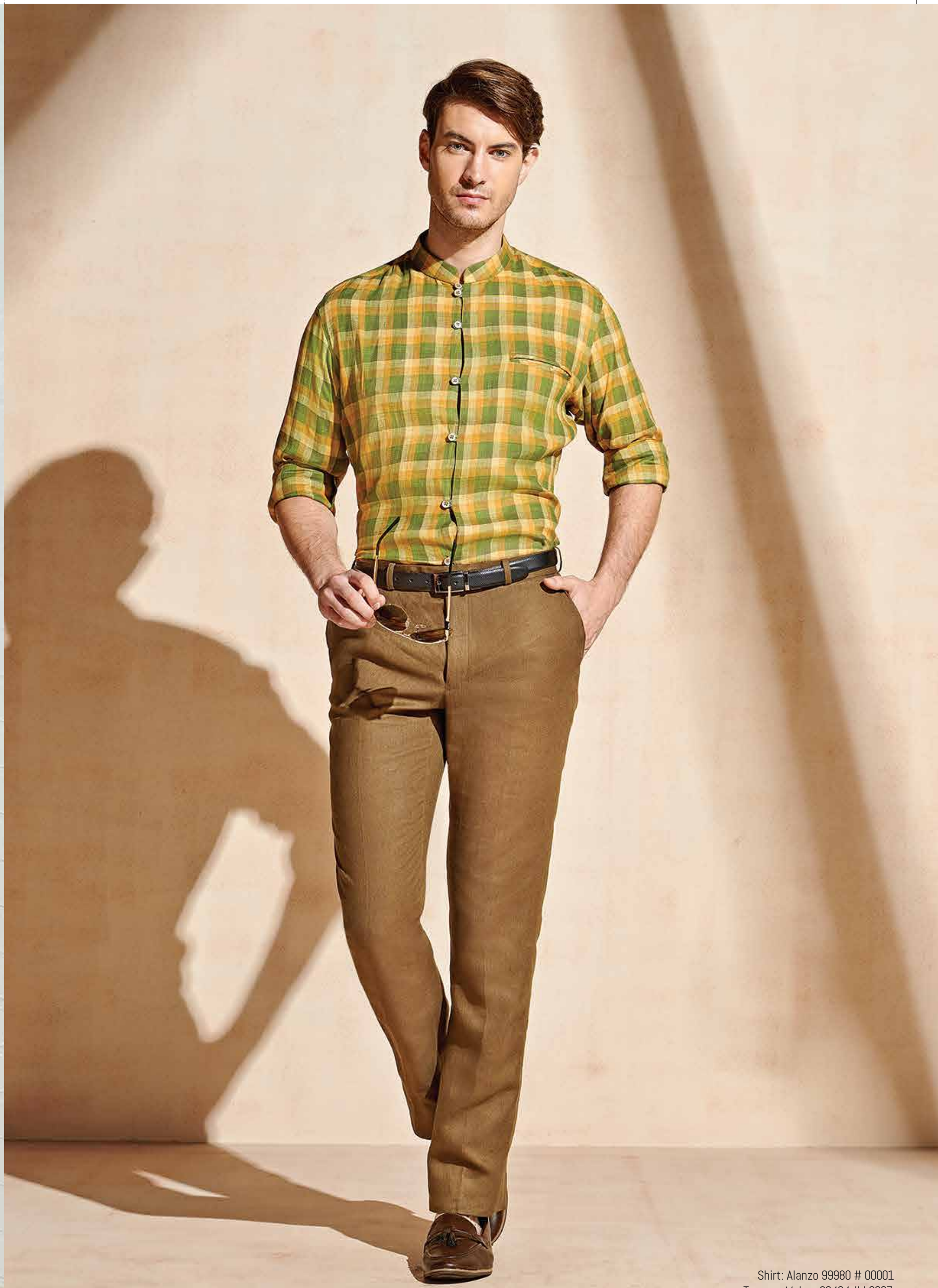
Shirt: Alanzo 99980 # 00001 Trousers: Malmo 86464 # L0007