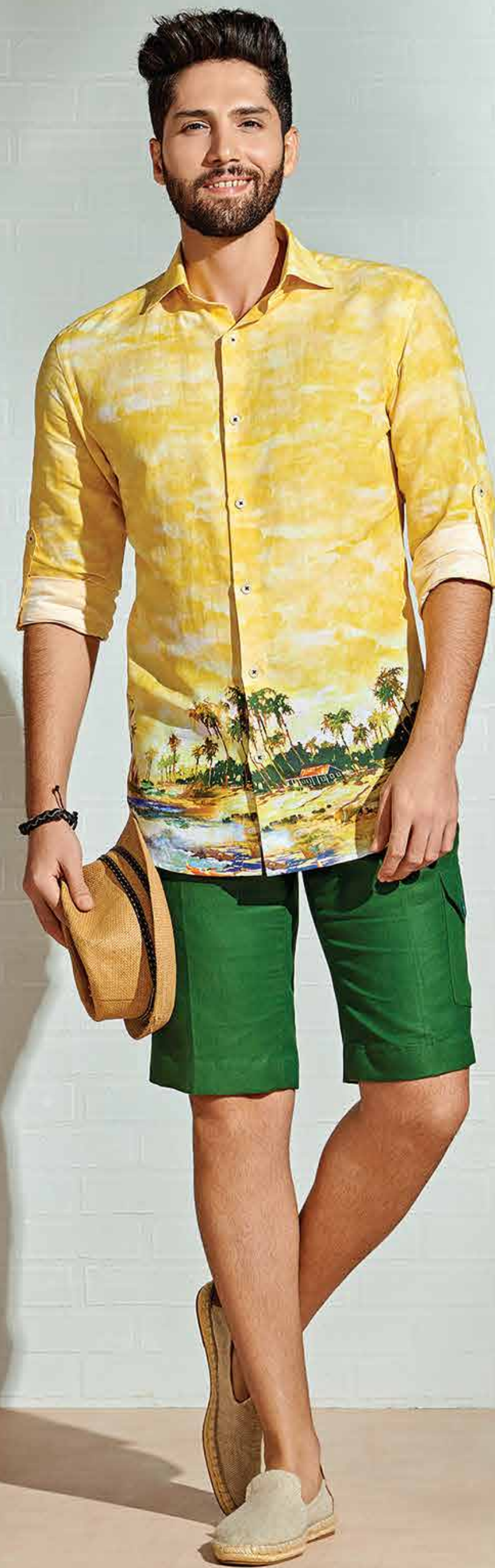
Shirt: GLENDALE ALMUS A1464 # 00001 Short: RF 8135 # L3136