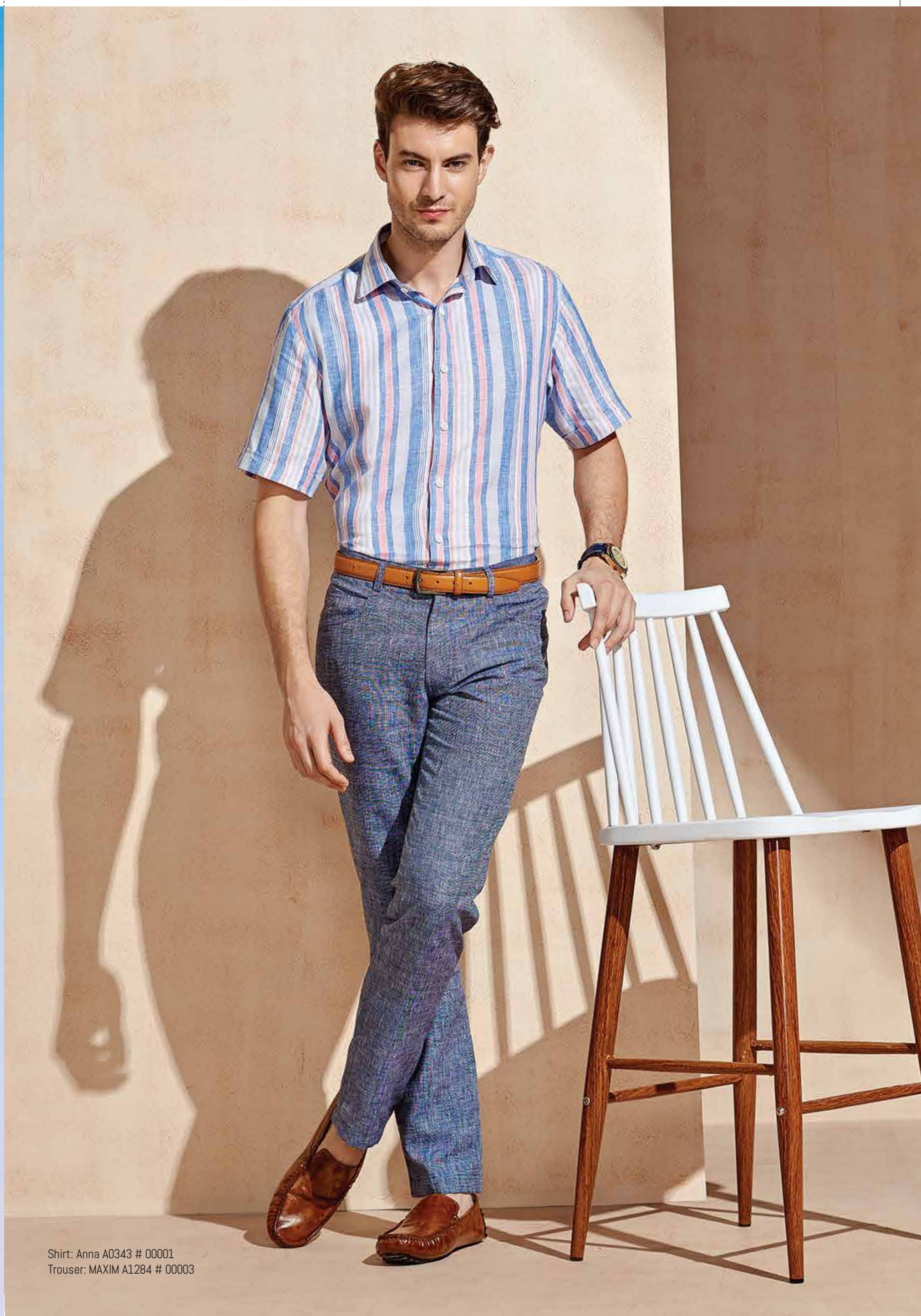
Shirt: Anna A0343 # 00001 Trousers: MAXIM A1284 # 00003