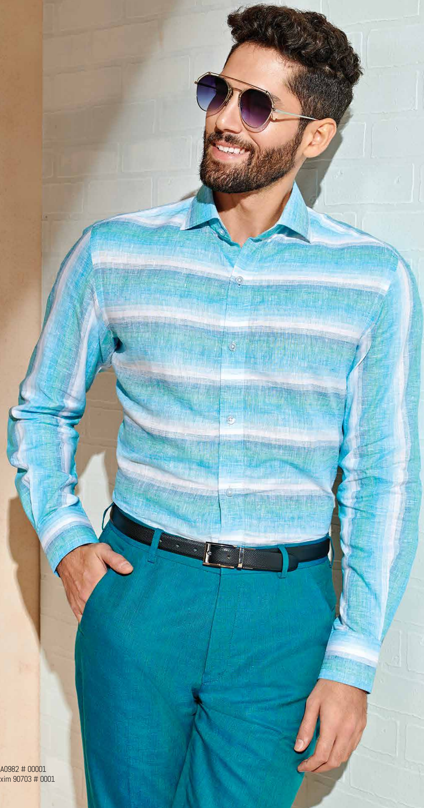
Shirt: Anna A0982 # 00001 Trousers: Maxim 90703 # 0001