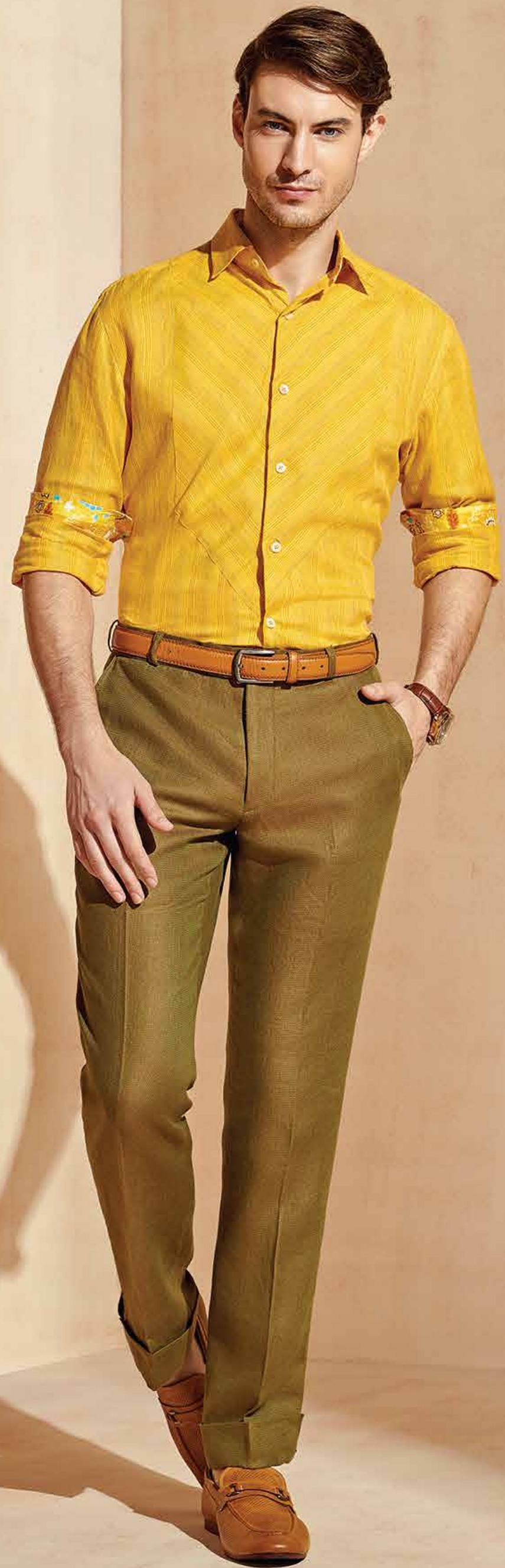
Shirt: Anna A0072 # 00007 Trousers: Malmo 86464 # L0007