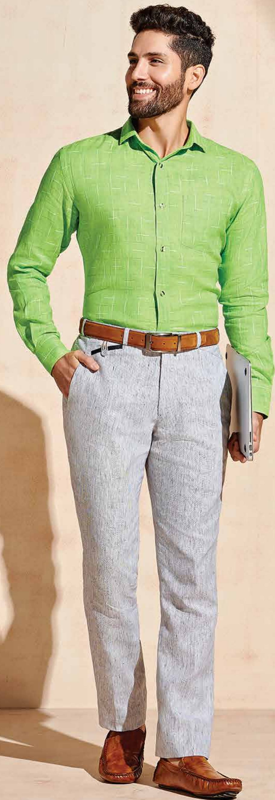
Shirt: Adonis A0316 # 00005 Trousers: Maxim 90678 # L0009