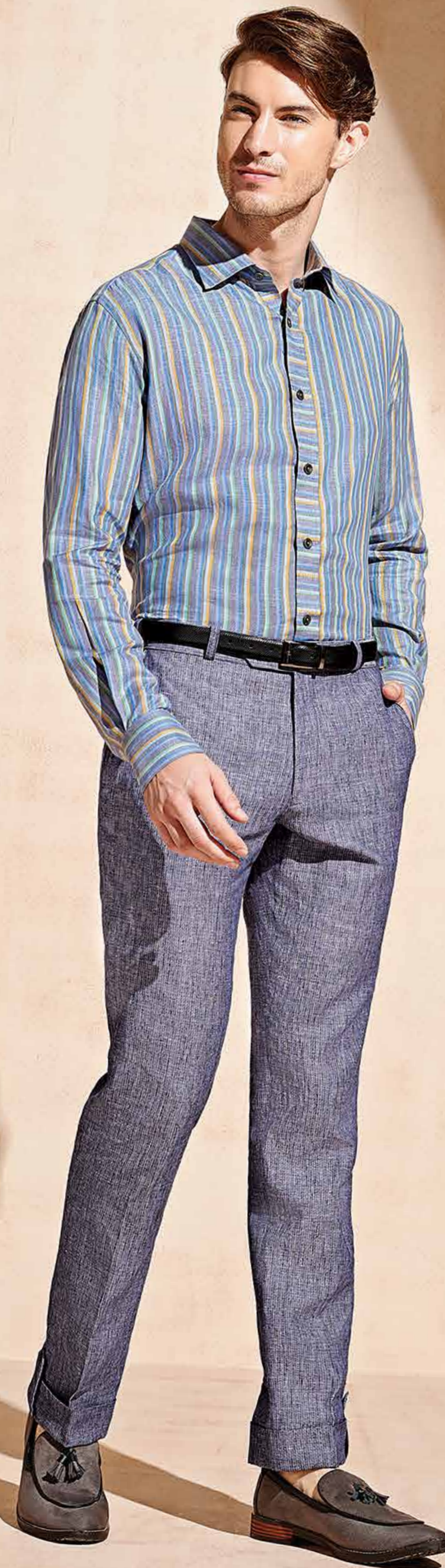
Shirt: Anna A0384 # 00002 Trousers: Maxim 87517 # L0006