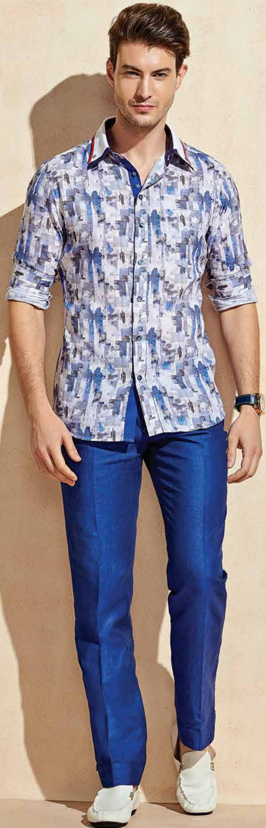
Shirt: GLENDALE A1465 # 00001 Trousers: MAXIM A1260 # 00001