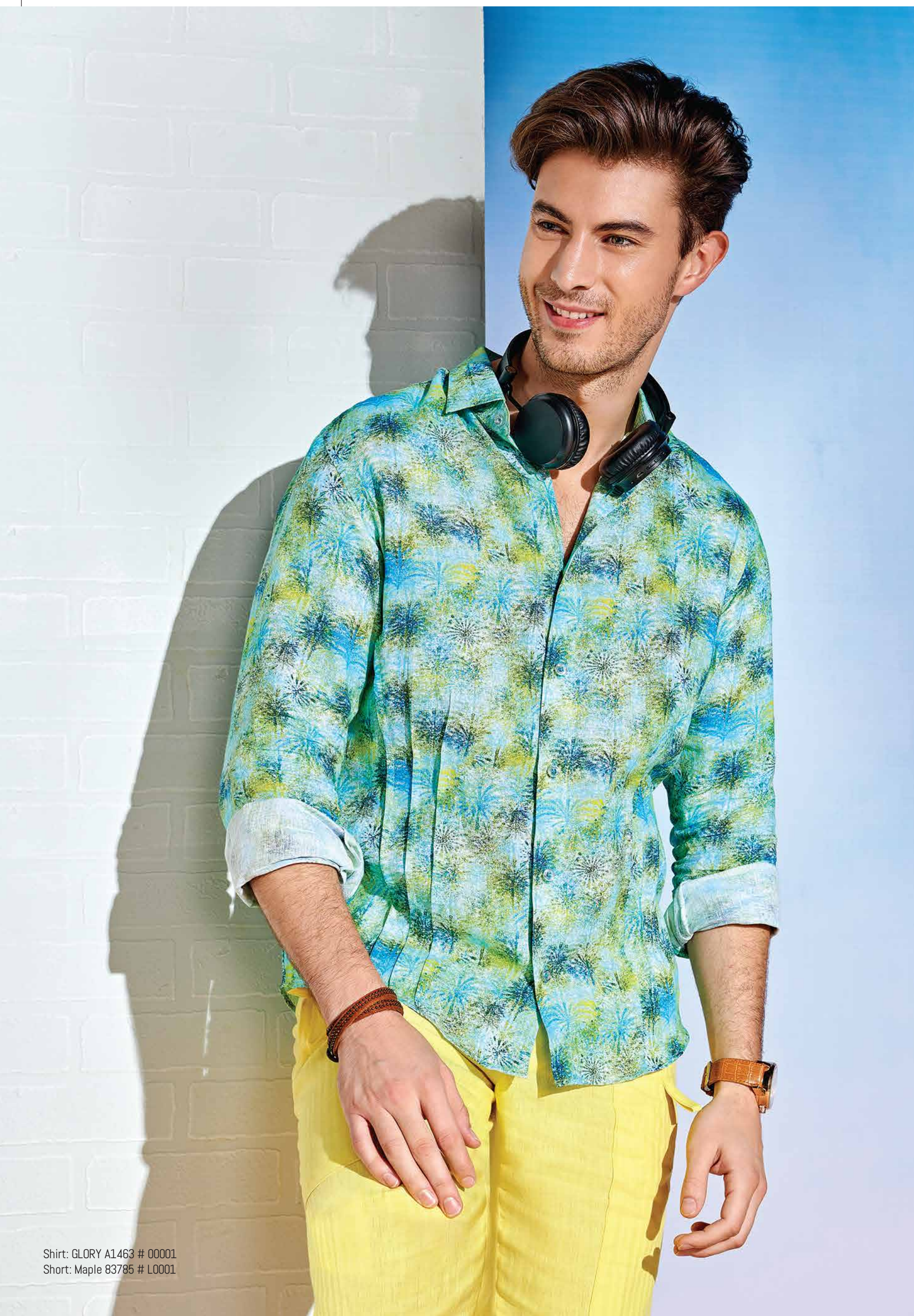
Shirt: GLORY A1463 # 00001 Short: Maple 83785 # L0001