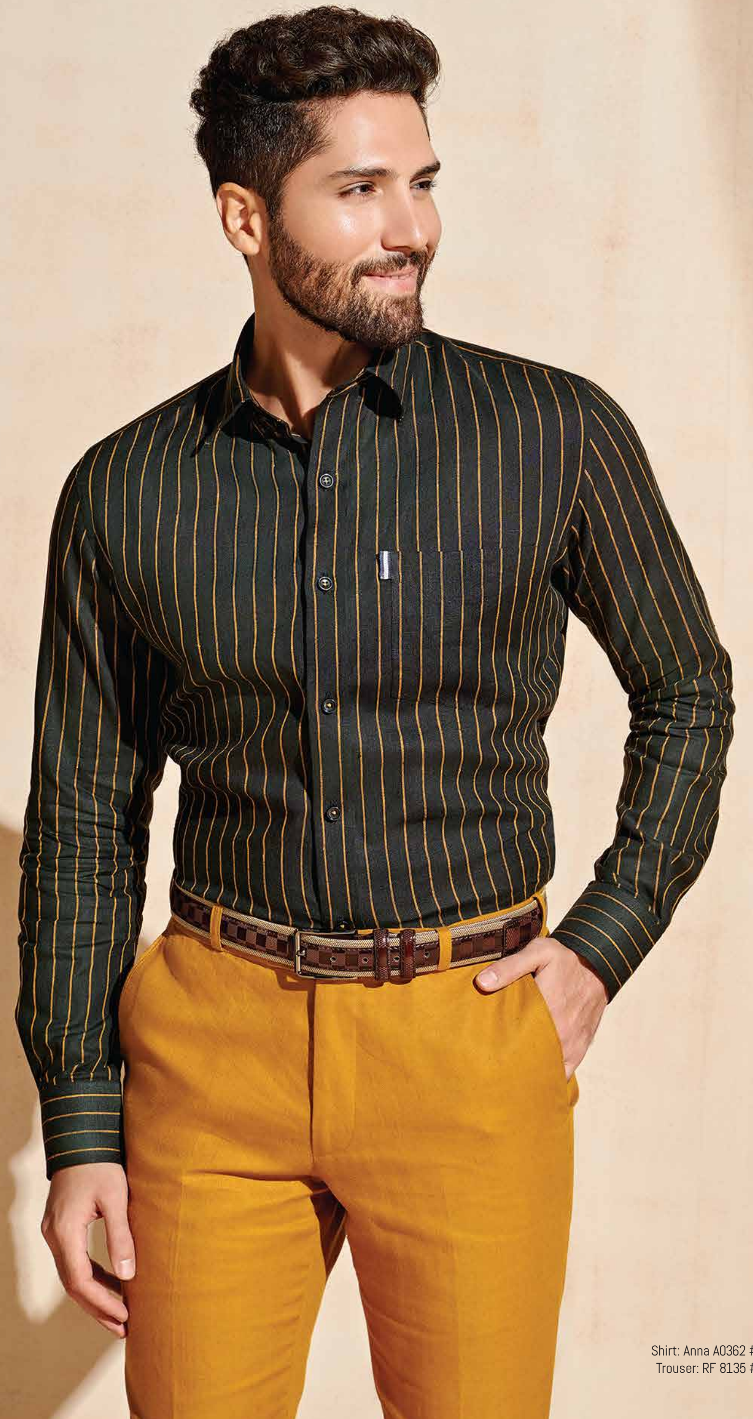
Shirt: Anna A0362 # 00006 Trousers: RF 8135 # L2083